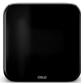
Cielo Smart Thermostat