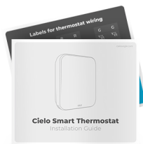
Installation Guide & Wire Labels