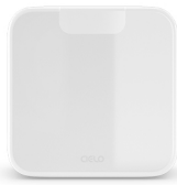
Cielo Breez Max