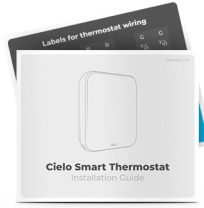
Installation Guide & Wire Labels