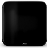
Cielo Smart Thermostat