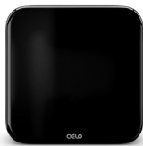
Cielo Smart Thermostat