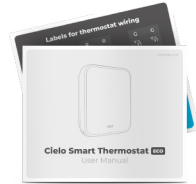
User Manual & Wire Labels