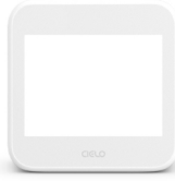
Cielo Smart Thermostat Eco